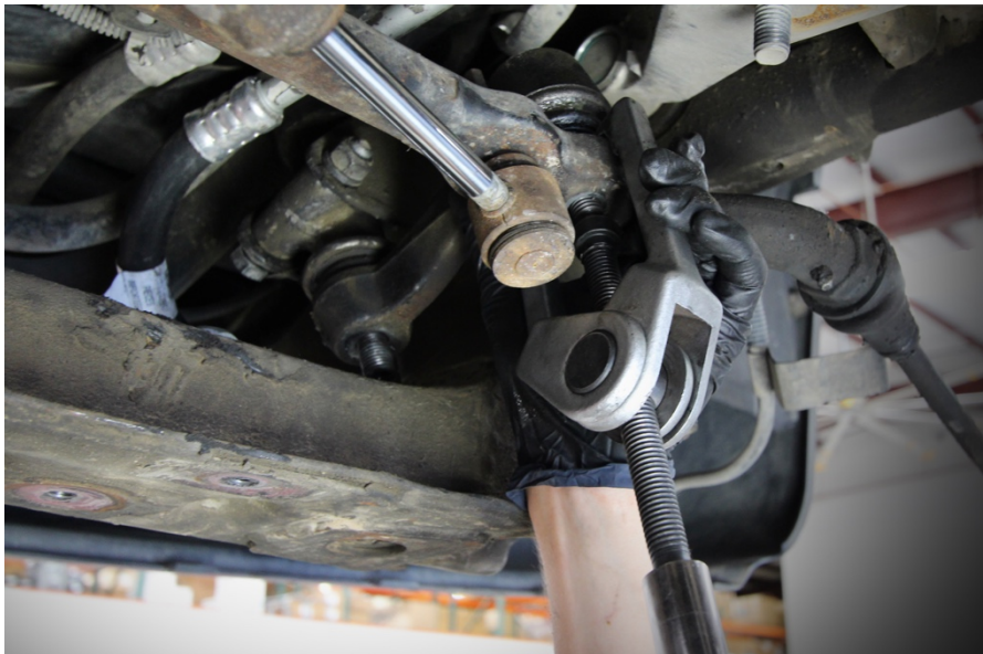
Figure 2. Remove center link with puller.