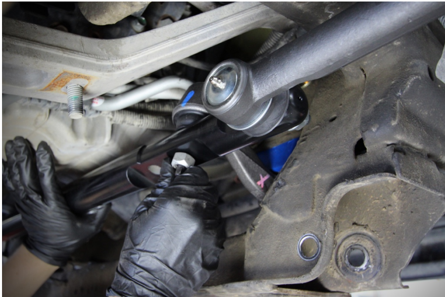
Figure 3. Center Link and inner tie rod.